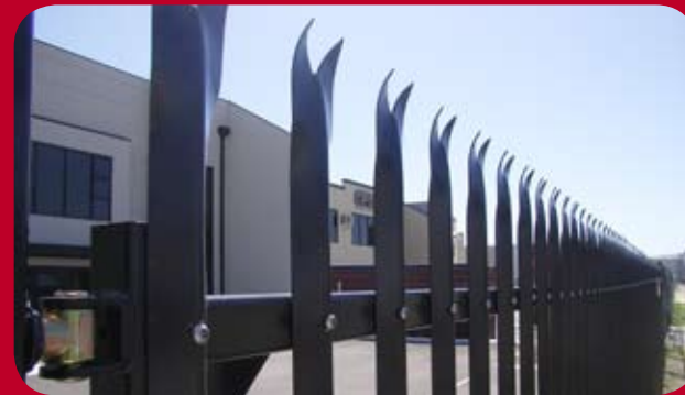
“V” Profile / Devil's Fork Spike