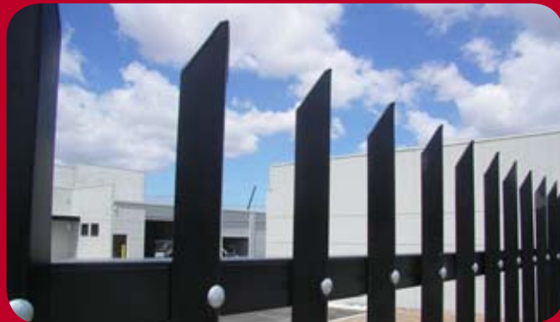
“V” Profile /Spearhead Spike