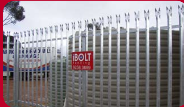
“V” Profile / Devil's Fork Spike