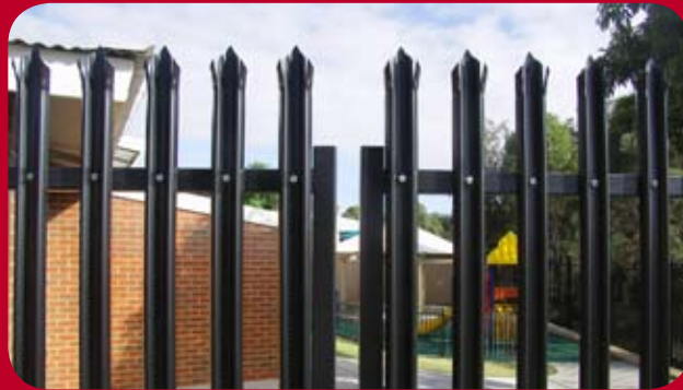
“W” Profile / Trident Spike

Palisade is offered in heights from 1,200mm to 3,600mm and also available for the DIY enthusiast.